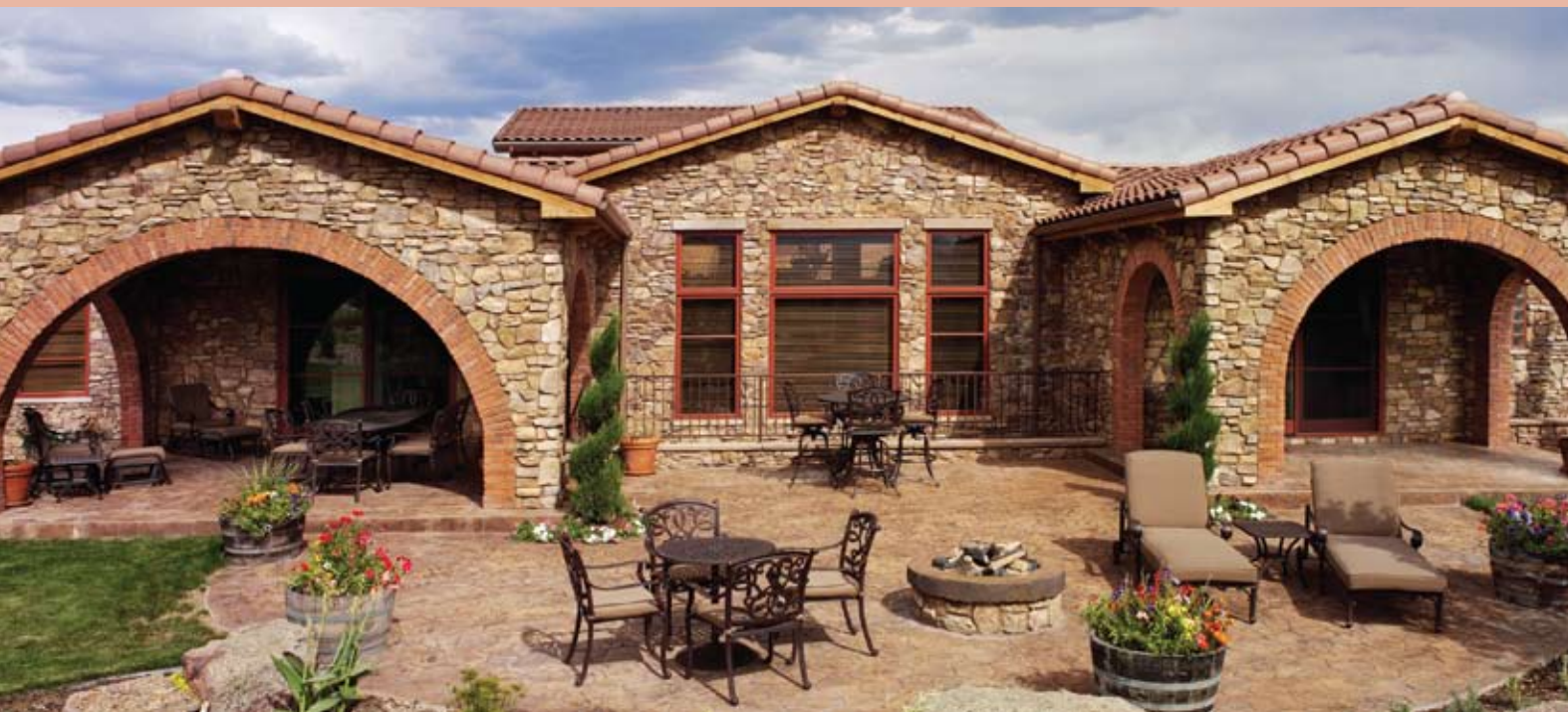
The Aspen Collection features our extruded aluminum clad exterior, available in more than 50 environmentally-friendly colors in 5 industry-leading color collections - and custom colors too.