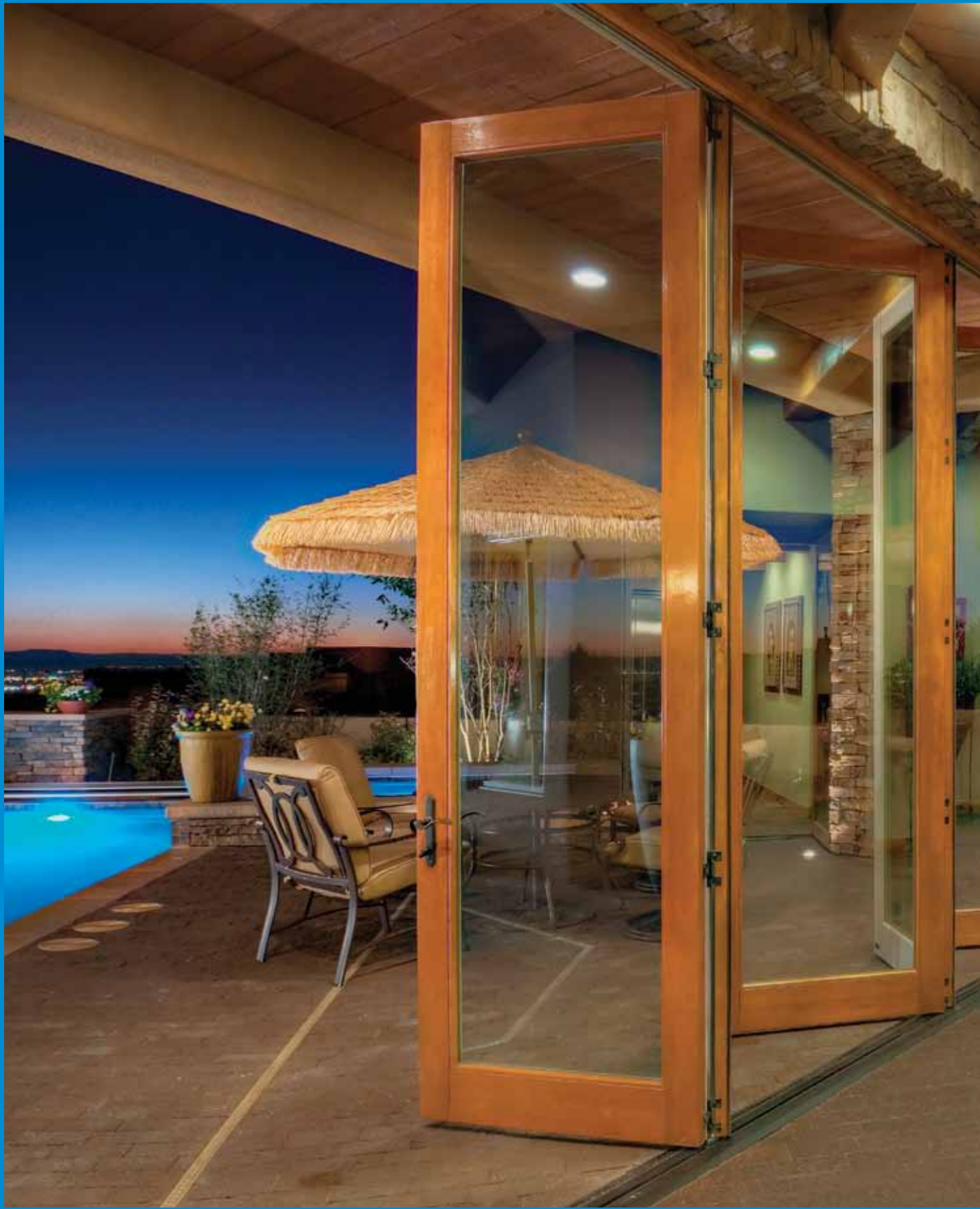
Project by Diego Handcrafted Homes