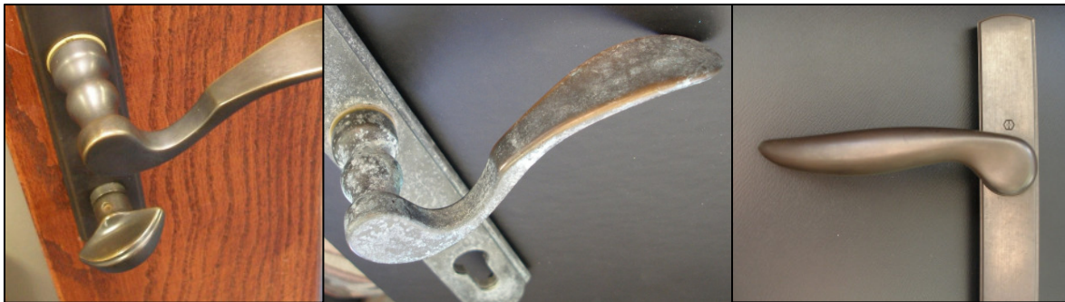
Light Use Yields Delicate Edge Highlights

The charm of true oil rubbed hardware lies within the many variations of finish and texture and the graceful aging that produces its beloved patina. As unique as an original work of art, no two pieces will be exactly alike. Colors and textures are intensified with time, and the appearance evolves to reflect the environment in which it has been placed. Exterior hardware will patina differently than interior hardware, just as pieces that are continually touched will wear differently than those that are not.